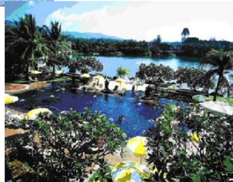
Spacious, Relaxing, Away from Chores!