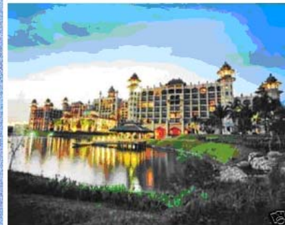
Imagine..... Being there, For A Week!